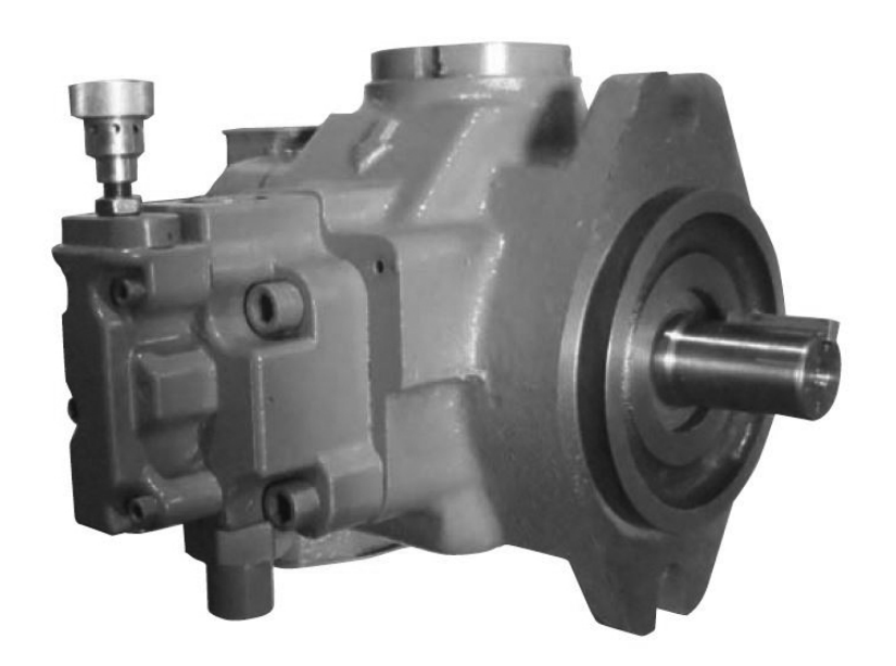
Variable vane pump brochure